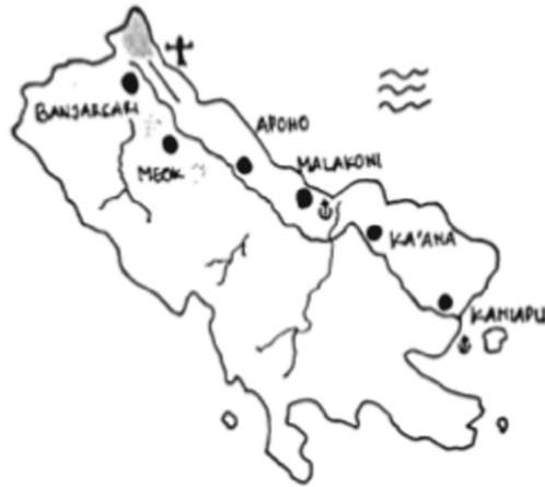
Fig. 1. Map of Enggano Island.

process can also be carried out according to the needs of the researcher. In terms of data processing, Miles and Huberman (1994) mention that there are three important stages, namely: data reduction, data presentation, and drawing conclusions. Data reduction is intended to streamline data that is considered important and supportive. Meanwhile, data presentation can be done as a good alternative. Presentation of data can be done in various forms, such as pictures, tables, graphs, charts, and so on. The last stage is drawing conclusions. This stage is intended to see an overview of the results of data analysis although it is still temporary, until the data obtained are sufficient to be used as final conclusions.