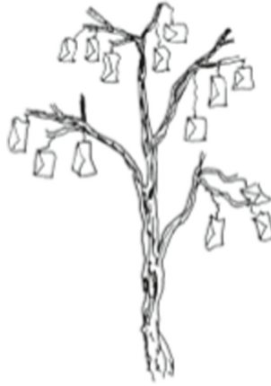
Fig. 3. The Illustration of 'Pohon Masyarakat'

moment of pahema , the dancers' hands go hand in hand with each other. Meanwhile, the poem ( iaru ) is sung by a group leader (soloist) whose contents are in the form of words and praises to the host in the implementation of the event or party. After the guest group is finished, then the verse will be replied to by the party host group with praise and thanks for the help and arrival of invited guests, in this case the members of the tribes in Enggano.